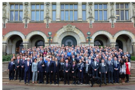
Seventh Annual Conference of P.R.I.M.E. Finance, 22 - 23 January 2018 Peace Palace, The Hague

The Permanent Court of Arbitration (PCA) is the world's oldest arbitral institution, with over a century of experience in administering complex international proceedings. P.R.I.M.E. Finance joined forces with the PCA in 2015, combining the subject matter expertise of its Panel of Experts with the PCA's administrative efficiency. As a result, arbitrations under the P.R.I.M.E. Finance/PCA Arbitration Rules are administered by the PCA. While the filing address for notices of arbitration is with the PCA at its Peace Palace headquarters in The Hague, arbitrations may take place anywhere in the world, and may be facilitated by the PCA's host country agreements with a number of its Contracting Parties. In addition, under the UNCITRAL Rules, as adapted for P.R.I.M.E. Finance, the Secretary-General of the PCA may act as appointing authority for P.R.I.M.E. Finance in cases where the parties cannot agree on the appointment of arbitrators. The Secretary-General of the PCA serves on the P.R.I.M.E. Finance Advisory Board.