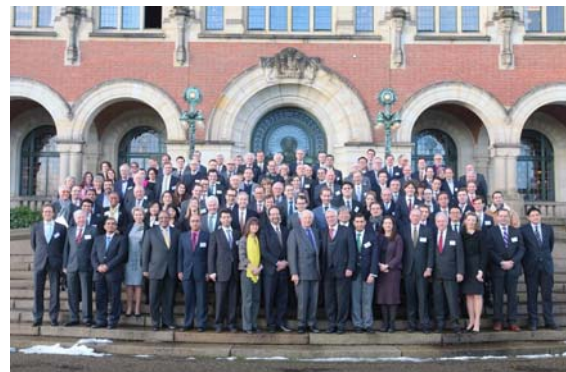
Second Annual Conference of P.R.I.M.E. Finance, 28 - 29 January 2013 Peace Palace, The Hague

Under the UNCITRAL Rules, as adapted for P.R.I.M.E. Finance, the Secretary General of the Permanent Court of Arbitration, also based in The Hague, may act as appointing authority for P.R.I.M.E. Finance in cases where the parties cannot agree on the appointment of arbitrators. The Secretary General of the Permanent Court of Arbitration serves on the P.R.I.M.E. Finance Advisory Board and has agreed that, if a request to him for the selection of arbitrators is made under the Arbitration Rules of P.R.I.M.E. Finance, he will select arbitrators exclusively from P.R.I.M.E. Finance's expert list. Disputes may be resolved anywhere in the world, however the Permanent Court of Arbitration has authorized the conduct of arbitral hearings at the Peace Palace arbitration suite in The Hague where the parties so elect.