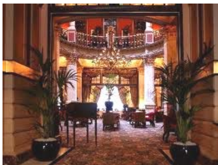
...Hotel des Indes...

Reception & Conference Dinner 27 January 2014 at 19:00